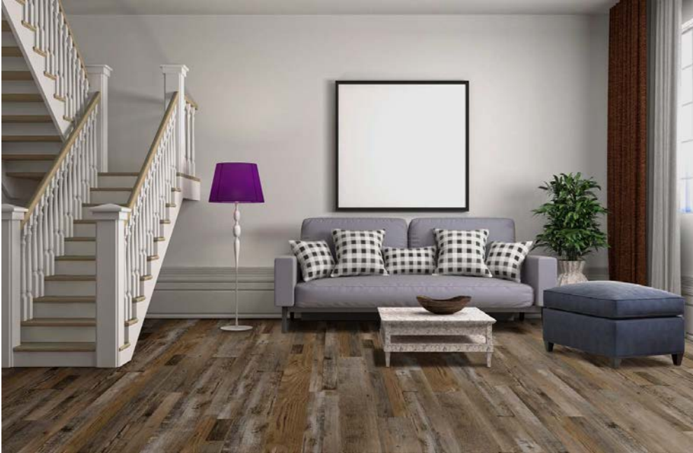
PINE BARK BROWN

Denali the newest items in the popular PVC based flooring environment. These products require no click system or adhesive for installation. Follow the instructions, loose lay over a smooth subfloor, and you will have a great new PVC based floor. We chose already proven designs so this is as easy as buy, lay, and enjoy.